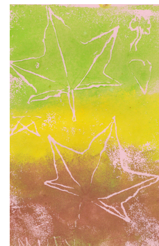
Polystyrene tile prints made in a 1/2 day workshop with children aged 5 – 10 at Holy Family Primary School Southampton.

For more information about our work with young people contact Sarah 07790 870558 or Katherine 07814 016563