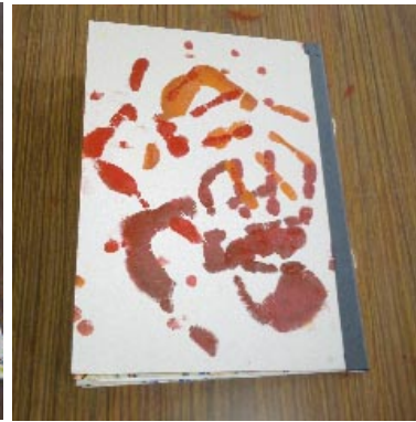
Books by students at Oasis Academy Lords Hill Southampton.